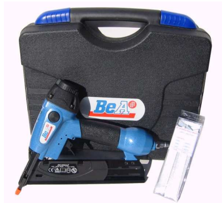
Tool case included